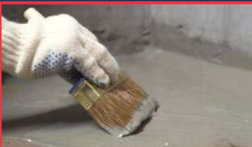
▶ Applying CW Seal 900 on the wall and floor to avoid the water from seeping in the structure.