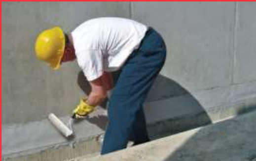
▶ Applying Excel Primer P-8700 on the concrete wall joints