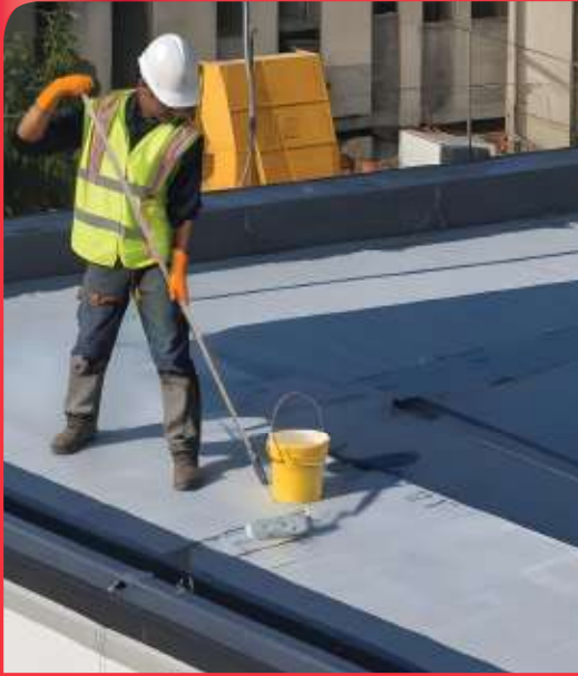
▶ Excel Proof 9200 & Fiber 9300 can be used to protect exterior areas such as the rooftop, wall, guttering and balconies.